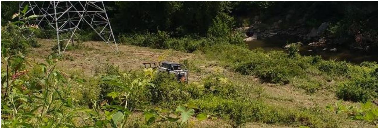
Dominion machines at work in the Accotink Gorge